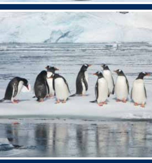
Images: Charles Mitchell with a picture of the park entrance to Torre Del Paine in Patagonia, Chile. Amazing photographs taken in South Shetland Islands, Antarctica Peninsular